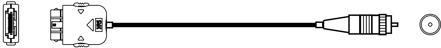
18 Pin Multiway to Optimus

T: 01723 891655 E: sales@cirrusresearch.co.uk W: www.cirrusresearch.co.uk